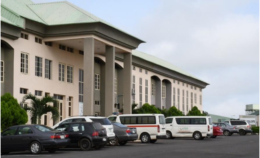
The Landmark Medical Centre