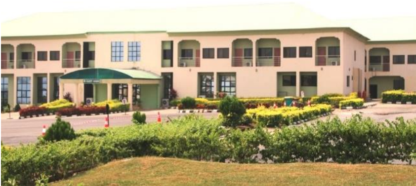
The Guest House