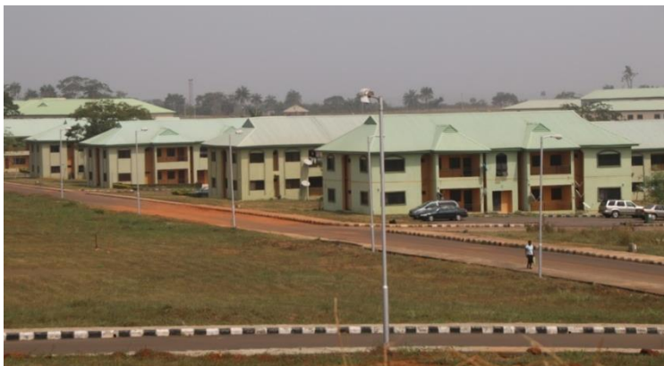
The Senior Staff Quarters

The three-bedroom blocks are 16 in number, provided as senior staff quarters in one storey blocks of four flats each. A block covers a floor area of 390 m 2 . Some major spaces on each block are Verandah, Living room, Dining, Kitchen, Store, three all en-suite bedrooms and Visitor's toilet.