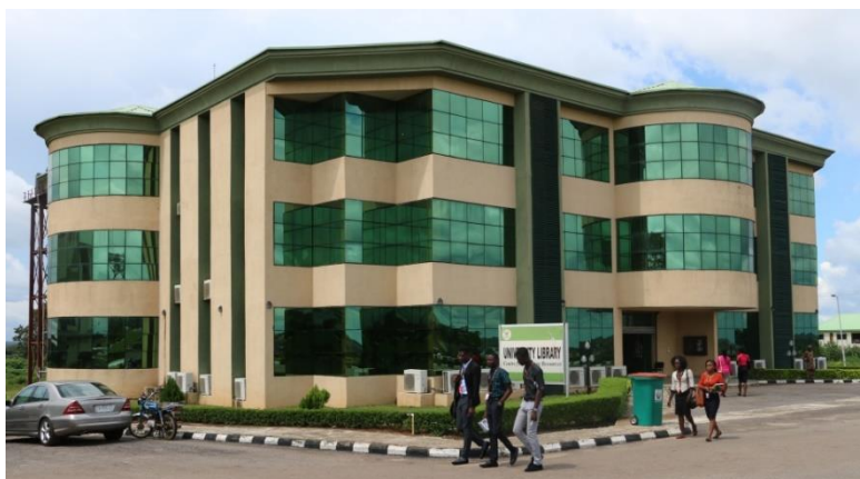
The Centre for Learning Resources

The University's Centre for Learning Resources (CLR) which is the University Library, is an imposing ultra-modern glass structure on three floors. The total floor area of the complex is 1,230m 2 . It is strategically located within close proximity to the College buildings, University Chapel and the Staff quarters.