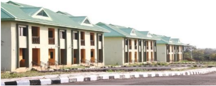
The Landmark University Staff Suites