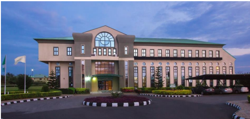
The Senate Building

The Senate building is an imposing two-storey building with a floor area totalling about 923 m 2 . The building is the main administrative hub of the University which houses offices of the Principal Officers