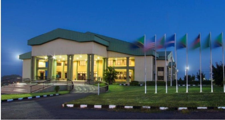
The Landmark University Chapel