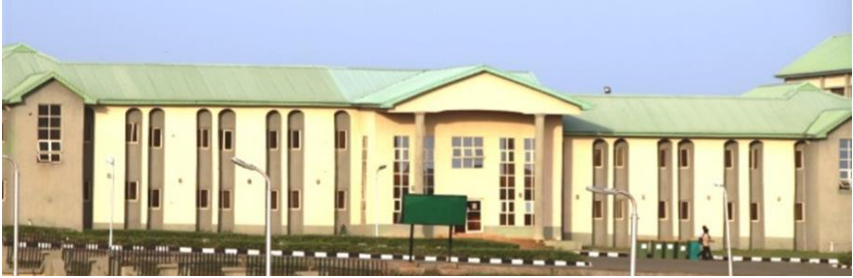
One of the Female Halls of Residence