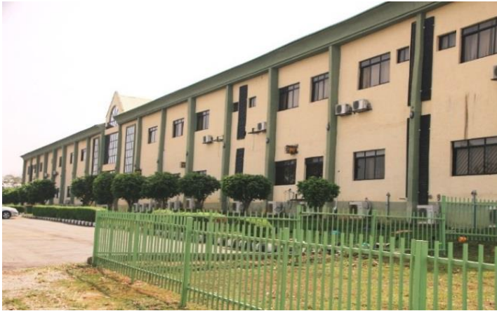
The College of Engineering Building

centre/technology incubation centre once the individual departmental workshops are completed.