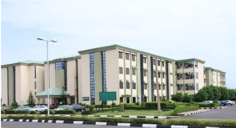
College of Science & Technology Building

science laboratories, state-of-the-art Computer laboratories that are equipped with a total of about 400 branded PCs, fully networked and linked to the Internet, classrooms, utility spaces, beautiful courtyards, conveniences etc.