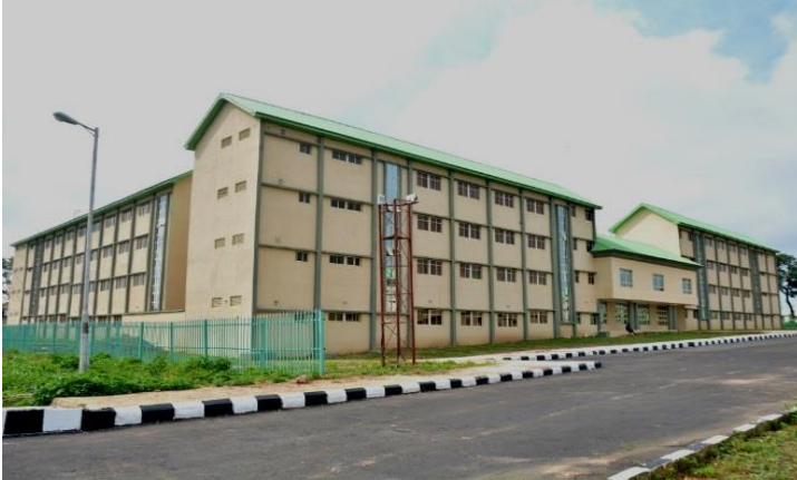
The Halls of Residence

The residence life of students is a communal life where a student's moral character and conduct can be moulded. The residency policy is to enhance peaceful coexistence amongst the students and facilitate good administration in the Halls of Residence.