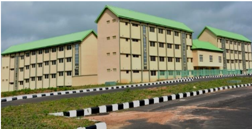
One of the Male Halls of Residence

All Landmark University Students reside in the halls on campus. There are 2 designs of the students' Halls of Residence.