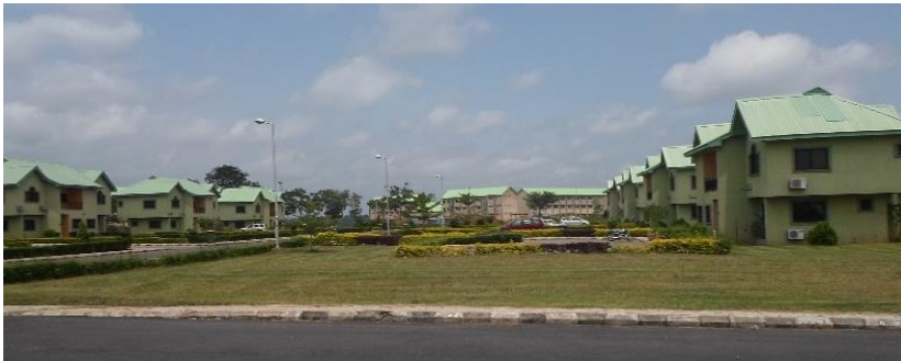
The Professors' Village

A one storey building of 284m 2 floor area, 20 units of these luxurious duplexes currently sit on campus. The last set completed in the year 2015, University principal officers is housed in these apartments. A large lounge adorns the facility at the centre and, all the bedrooms en-suite, all endowed with plush lawns.