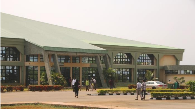
Landmark University Cafeteria